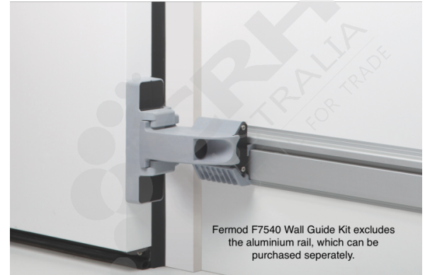
Fermod F7540 Wall Guide Kit excludes the aluminium rail, which can be purchased separately.